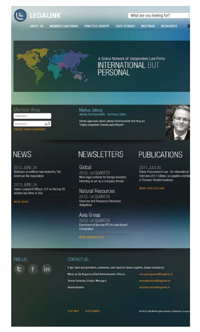
An overview of the entire (legal) world: www.legalink.ch

The team of Jakoby Rechtsanwälte helps foreign clients in all issues related to the German market including establishing subsidiaries or branch offices and advising on joint ventures.